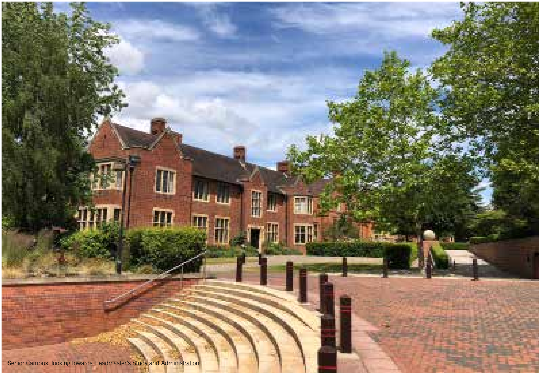
Senior Campus: looking towards Headmaster's Study and Administration